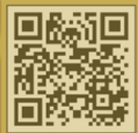
PTSO Membership Form