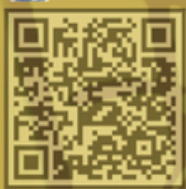
Western Guilford High School PTSO