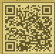
Cart 2 Class