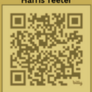
Together in Education